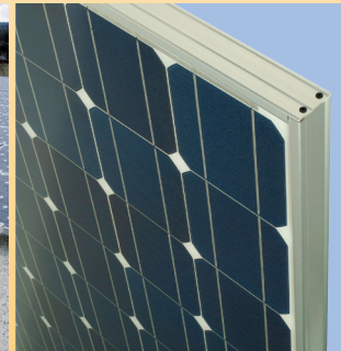
Improved Frame Technology