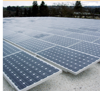
The NU-U240F2 offers industry-leading performance for a variety of applications.

156 mm pseudo-square monocrystalline solar cells provide high power output. Ideal for large commercial rooftops where space is a premium.